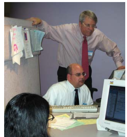
Volunteers from Community Tax Aid, Inc., provide free tax preparation assistance at ADSS.